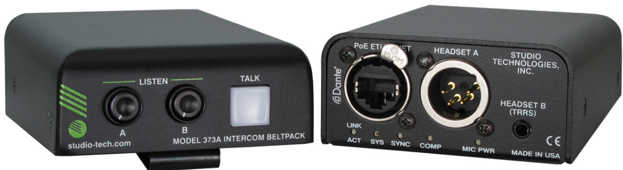
Figure 1. Model 373A Intercom Beltpack top and bottom views

Setting up and configuring a Model 373A is simple. An etherCON® RJ45 receptacle is used to interconnect with a standard twisted-pair Ethernet port associated with a local-area network (LAN). This connection provides both power and bidirectional digital audio. The Model 373A is compatible with both broadcast and "gaming" headsets.