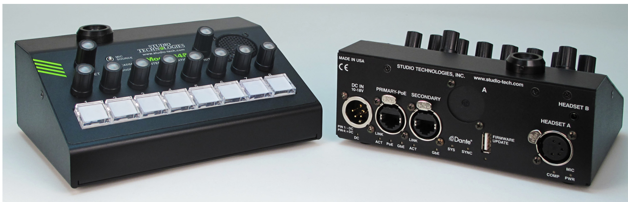
Figure 1. Model 348 Intercom Station front and back views

The Model 348 allows connection of broadcast- or intercom-style headsets that use a dynamic or electret (DC powered) microphone. The unit provides both 5-pin female XLR and 3.5 mm TRRS connectors which allow both traditional "pro" and contemporary gaming headsets to be utilized. In addition, the Studio Technologies' GME-3-12 electret gooseneck microphone can be directly connected using the ¼-inch jack located on the top of the unit's enclosure. A pushbutton switch allows users to directly select headset or gooseneck microphone operation. A low-noise microphone preamplifier and associated voltage-controlled-amplifier (VCA) dynamics controller (compressor) ensures excellent microphone audio quality while minimizing the chance of signal overload.