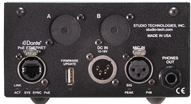
Figure 1. Model 215A Announcer's Console front and back views

power is provided and meets the worldwide P48 standard. A dual-color LED indicator serves as an optimization aid when setting the gain of the microphone preamplifier.