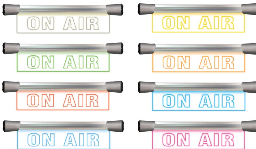
LD-40F1ONA Single flush mounting 40cm 'ON AIR' sign showing different available colours.

Contact Sonifex for information on pricing and your nearest distributor