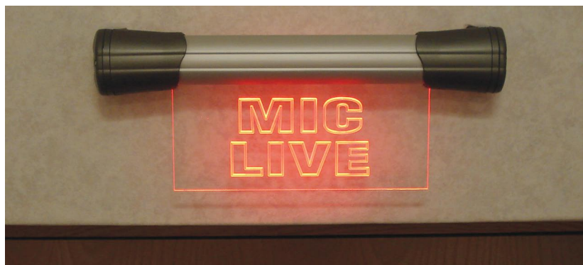
LD-20F1MCL Single flush mounting 20cm 'MIC LIVE' sign

The new range of SignalLED illuminated signs are for use outside recording studios, on-air & production studios, meeting rooms, conference rooms and for fixed installations. The signs can be configured onsite for your particular colour and signalling requirements.