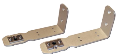
The LD-KC1 mounting kit.

The LD-KC1 mounting kit can be used to attach a 40cm or 20cm flush mounting sign to the ceiling or a desktop.