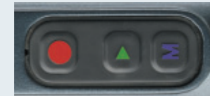
FlashMic screen and on-body controls