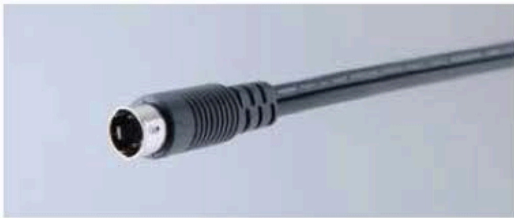
Part No.5139 ASSEMBLY