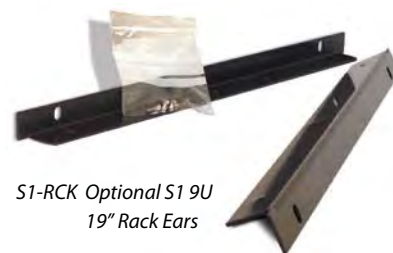
S1-RCK Optional S1 9U 19" Rack Ears

The S1 mixer is highly configurable and has numerous options allowing the mixer configuration to be tailored to your requirements. Using the freely available Sonifex Sci software, every parameter of the mixer can be set up with ease.