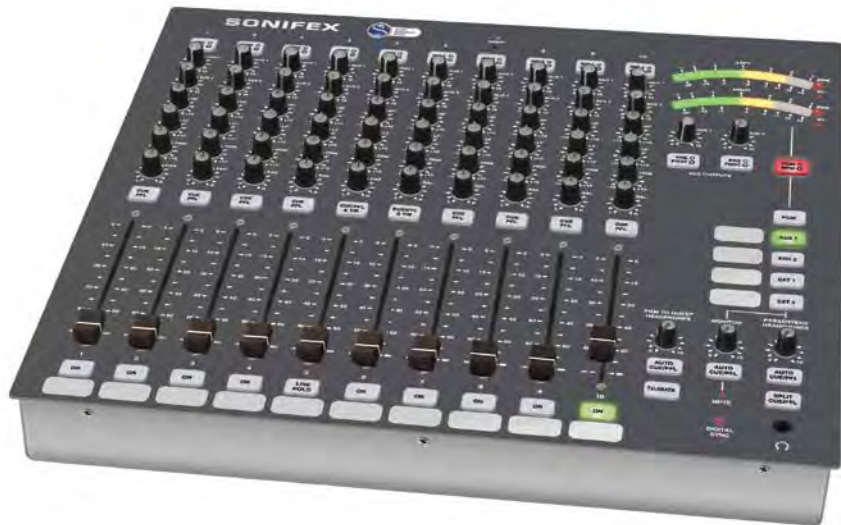
S1 Digital/Analogue Radio Broadcast Mixer

It has a 'no compromise on quality' approach with excellent mic amps, comprehensive facilities & simple, reliable operation.