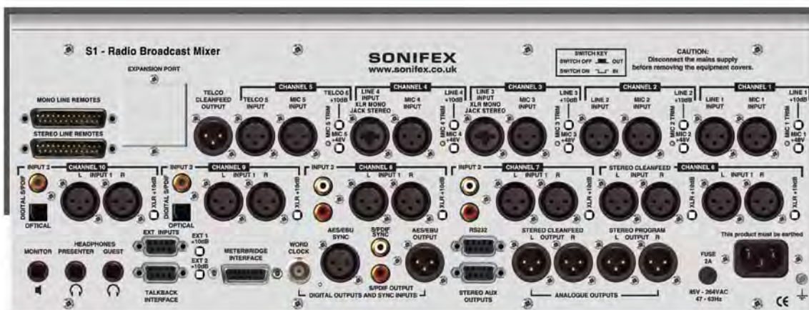
S1 Digital/Analogue Radio Broadcast Mixer, Rear View