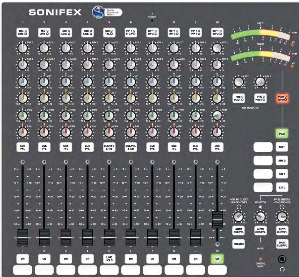
S1 Digital/Analogue Radio Broadcast Mixer, Front View